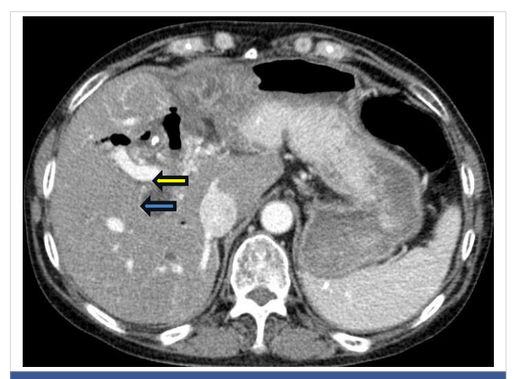
Figure 2: CT of the abdomen in transverse view on March 2023 showing near complete resolution of the tumor (yellow arrow) with marked improvement in dilatation of the right hepatic duct (blue arrow).

fatigue, hypothyroidism, and diarrhea, lenvatinib required dose reduction and interruption, while pembrolizumab was continued every 3 weeks until October 31, 2023, totaling 38 cycles The patient was then hospitalized due to pancolitis and hepatitis, likely attributable to Pembrolizumab side effects. Her CT scan on October 10, 2023, revealed disease progression with the reappearance of a tumor mass near the right intrahepatic bile duct and biliary dilatation. Treatment was planned to switch to a capecitabine and oxaliplatin